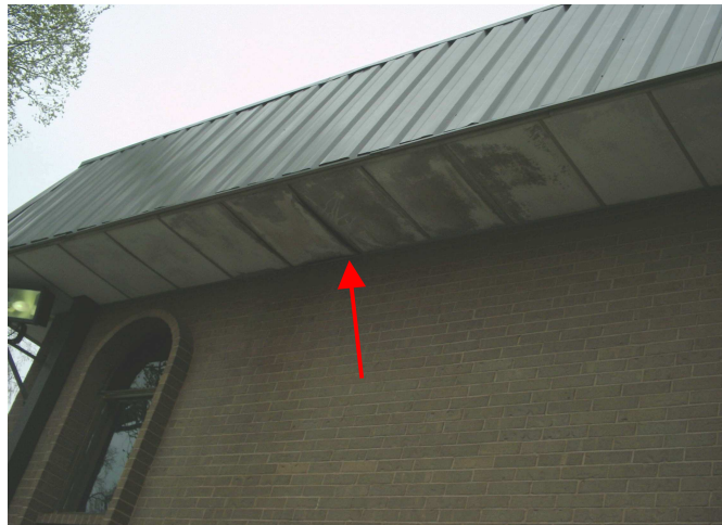
Figure 1. Roof eave before repair.

The following images show a roof area on a commercial building. Figure 1 shows obvious damage to the acoustic tiles used for the soffit. The source was a leaking gutter above the soffit. The gutter was supposedly repaired and the tiles were replaced. The repaired area does not appear to show any signs of leakage. However, in Figure 2, infrared imaging shows that gutter is probably still leaking and the same problem will begin to show itself after time. The infrared image was taken two days after rainfall and about 1 month after the repairs were made.